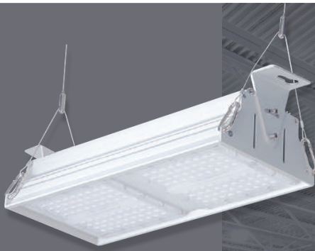
* Motion sensor attached

Applications Warehouse facilities, manufacturing facilities, workshops, convention centers, exhibition halls, sporting arenas, big-box retail stores, large supermarkets, cold garage facilities, storeroom, toll stations, gas stations, and gymnasiums.